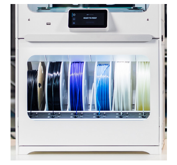
Ultimaker S5 Material Station

Ultimaker S5 3D printer is required for use